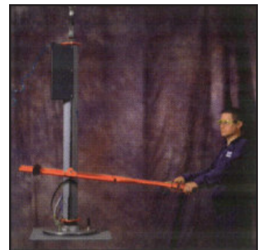
This Lite V-Lift with vacuum tool offers an economic solution for simple straight-line transfer.