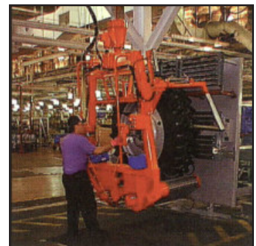
This specialized tool allows for the installation of 2,800 pound tires onto a tractor.

Power requirement: 90 psi clean, dry air or 220/440 VAC.