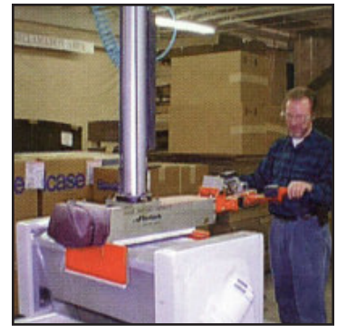
Tool transfers packaged 150 pound furniture products off end of assembly line.