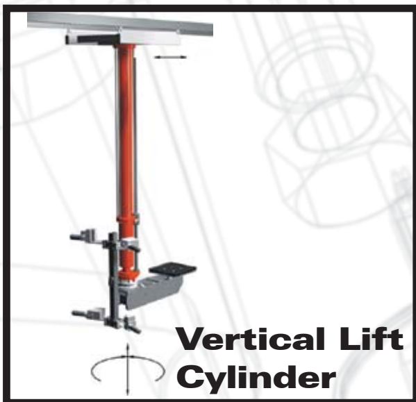
Vertical Lift Cylinder

Problem: Two machining centers in a 16'x16' workcell. One operator is expected to keep the manufacturing process at peak efficiency while manhandling light, but rather large 20" diameter parts. The safety and ability of the aging workforce to maintain the required cycle time parameters of the workcell led the end-user to seek an ergonomic solution to this material handling problem.